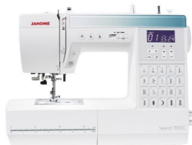
Sewist 780 DC

NEW Machines with full support - lower than the internet! Prices as low as $199!